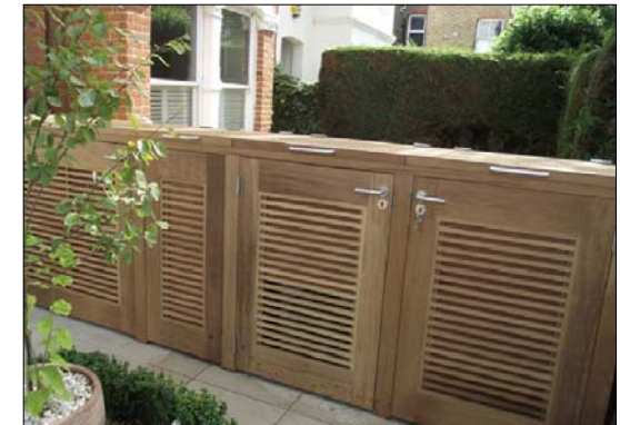
TIMBER REFUSE AND CYCLE STORAGE ENCLOSURE